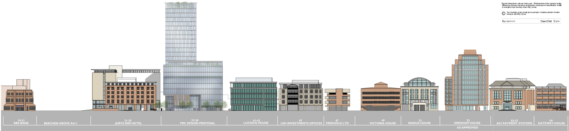
CLARENDON ROAD PART STREET ELEVATION SCALE 1:500 at A1