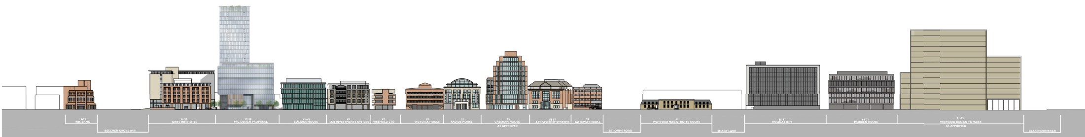
CLARENDON ROAD FULL STREET ELEVATION SCALE 1:1000 at A1